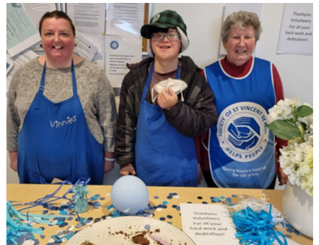
Some of our volunteers celebrating "Volunteer Week"