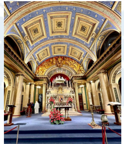
The reliquary above the altar containing the remains of St Vincent de Paul